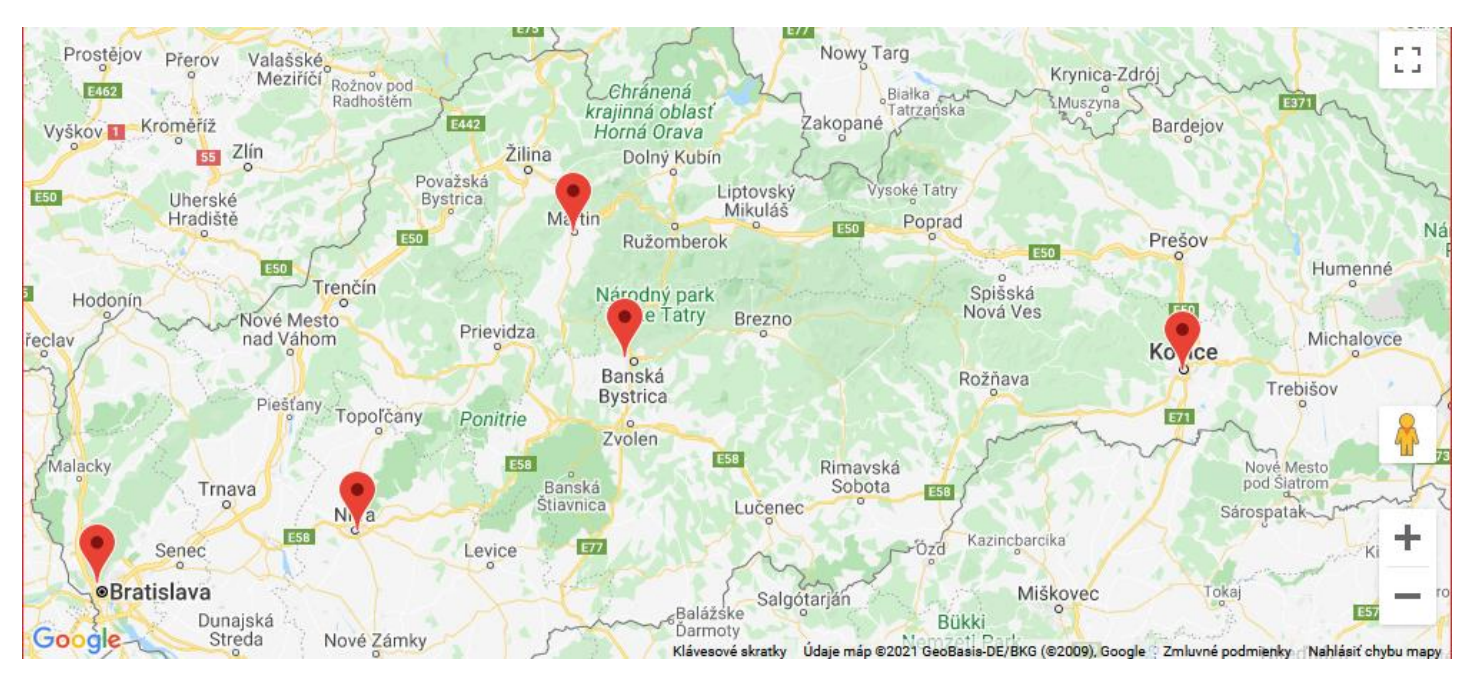
Five centers for HIV positive patients in Slovakia